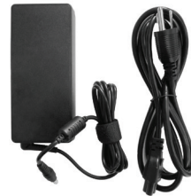
Power supply and cable