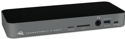
OWC Thunderbolt 3 Dock